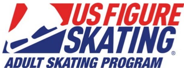
Figure Skating Club of Madison March 21-23, 2025

Madison Ice Arena 725 Forward Drive Madison, WI 53711