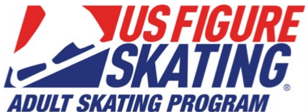
Figure Skating Club of Madison March 21-23, 2025

Madison Ice Arena 725 Forward Drive Madison, WI 53711